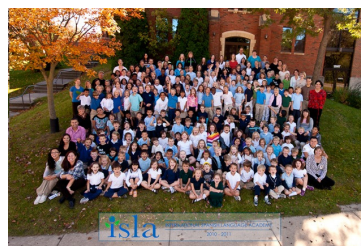
2010-12 All School Picture

The Yearbook Committee is also seeking candid photos to include in the yearbook. Have some great shots? Please save them to a CD and leave them in the ISLA office for the Yearbook Committee.