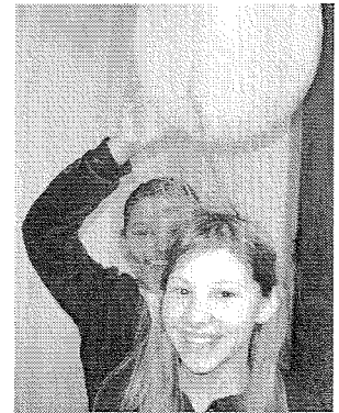
Students learn about energy and magnetism in Science class

5th graders are about to finish Unit 4 on division 6th graders are also about to finish unit 4 on fractions.