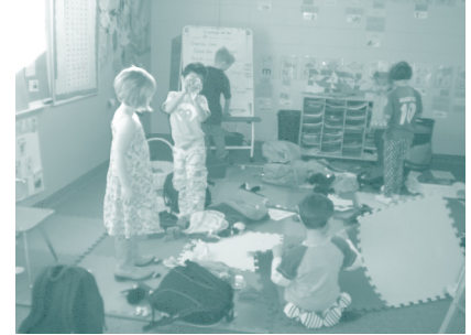
Los duendes no eran amistosos.