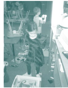
Many students were upset with the trickster duendes that visited on March 17

ing maps. Each student drew a square of the classroom map and then each student has been working on making a map of the classroom on their own. The last game we've learned with coins is a matching game in which they try to fill up the grid. Its really fun for them to play!