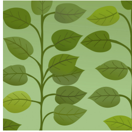
Counting leaves or other tree products through touch gives a sensory memory to recall.

The students practiced looking around the room for patterns at the beginning of this week. We discussed that a pattern/el patrón is something that repeats in a definite order. This simple activity always amazes me, the students are able to observe and point out many patterns in details I never would have thought to use as an example. Our next lesson for the week worked at creating patterns using different objects. Students selected plasticina/clay, bloques