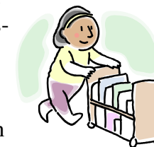
Lunes book return!

students/families choose to keep them in the classroom. If books come home, remember to get them back on lunes/Monday! Every so often library books get mixed in with the classroom library,