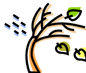
Leaves in plastic bags will be added to be pressed on Monday October 26th

various collections of leaves and enjoy the walk with us. With phone books we began pressing the leaves to use later in various projects. Students can collect five more tree items from the ground to bring to school if they choose, they will be added to their collection.