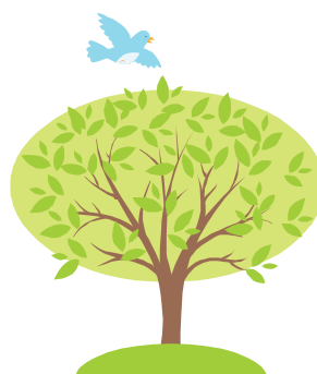
New goals for a new year

If you student is communicative with you about school (many probably are not) ask them about their