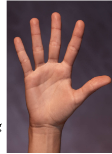
You'll see tally marks again in the homework packet!

At the end of last week the class worked to prepare for the lesson of making tally marks/marcas de conteo.